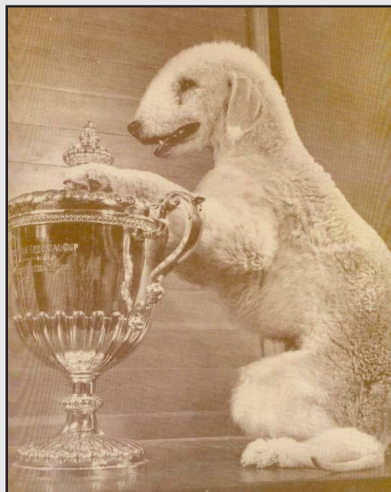
CH Rock Ridge Night Rocket Westminster Kennel Club 1948, Best In Show

Through the continuing efforts of the AKC and the BTCA, the Bedlington Terrier will competitively endure in all arenas as well as in our hearts. Congratulations to the AKC on 125 years!